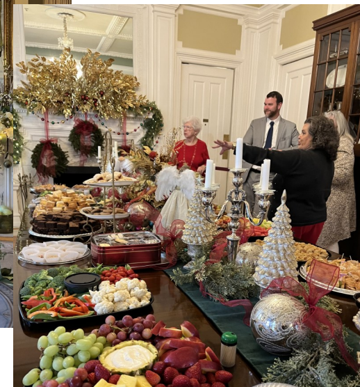
Governor's Tea and Tree Lighting