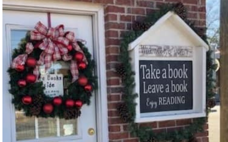
Wedowee Garden Club decorates in the community