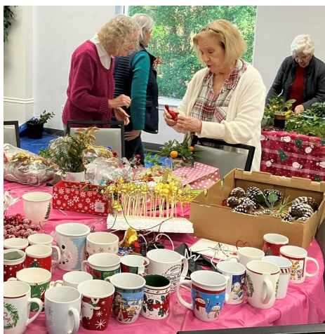
Fairhope Garden Club makes coffee cup arrangements for local nursing homes