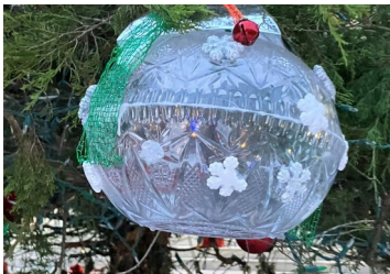
An ornament made by one of our clubs